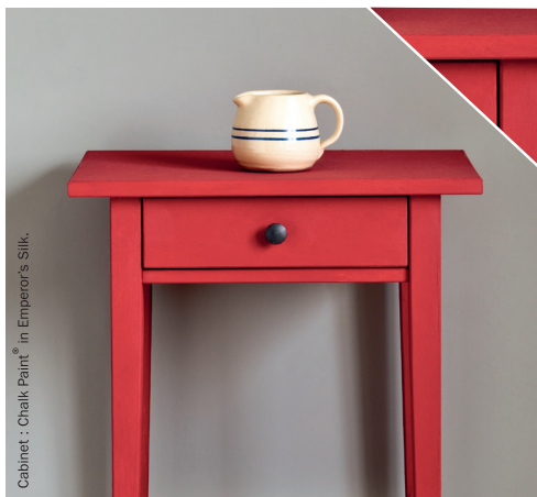
Cabinet : Chalk Paint® in Emperor's Silk.

Tip To remove excess colored wax, use a little Clear Chalk Paint® Wax on a lint-free cloth and rub away.