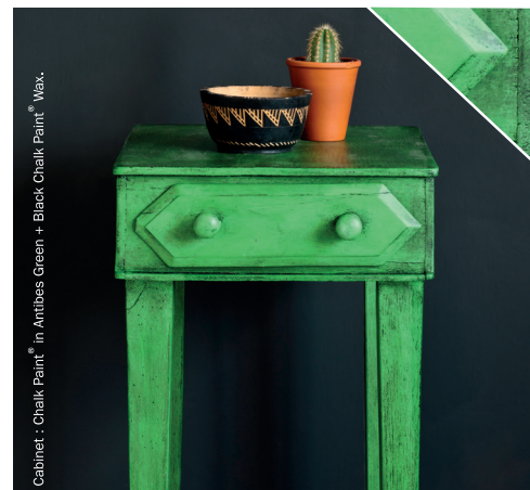
Cabinet : Chalk Paint® in Antibes Green + Black Chalk Paint® Wax.