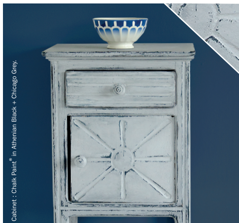
Cabinet : Chalk Paint® in Athenian Black + Chicago Grey.